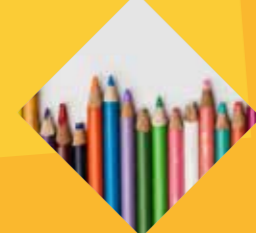
Arts & Craft